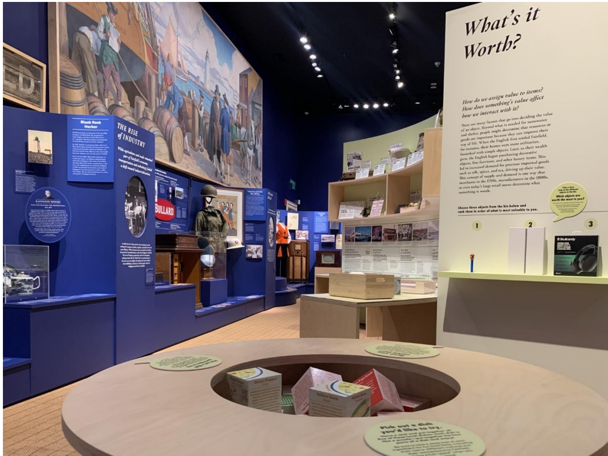
Some parts of the Creating Community exhibition have hands-on activities that the whole family can try out.